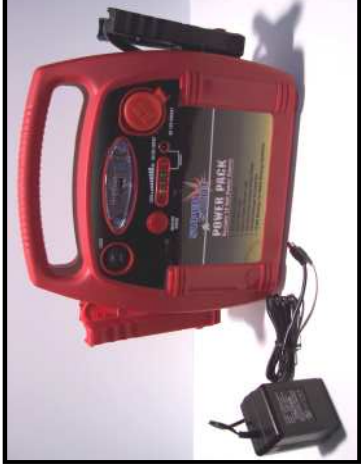
12 volt battery pack

Studies have shown this filter to be very effective at removing microscopic particles of harmful substances from the water supply.