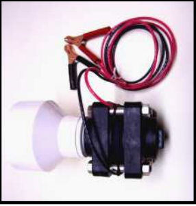
Khlor Gen 3000

The I.W.M.S. hand held chlorine producing unit is a simple tool designed to enable people all around the world an opportunity for safe water.