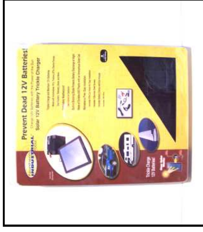
12 volt solar charger

The I.W.M.S. hand held chlorine producing unit is energized by most 12 volt power supplies, such as a car battery or a converter source. I.W.M.S. offers an alternative power source consisting of a 12 volt battery pack with a recharging unit and a 12 volt solar charger panel also used as an alternative recharging source for the battery pack.